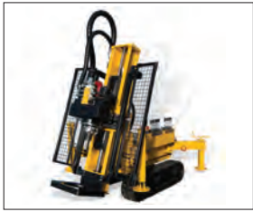
Hammer Drilling Rigs