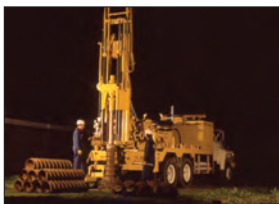
Central Mine Equipment