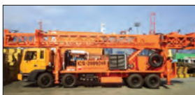
Chang Shin International