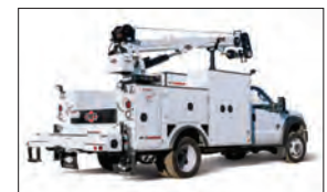
Iowa Mold Tooling